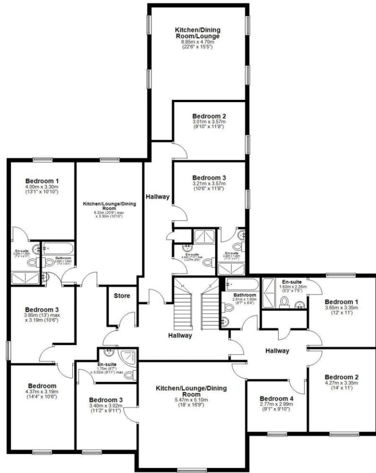
First Floor Approx. 270.5 sq metres (2911.9 sq. feet)