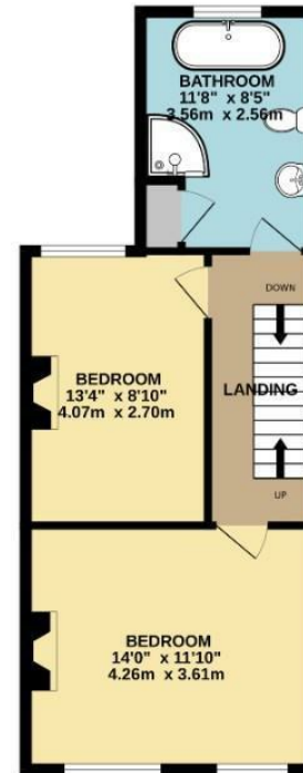
1ST FLOOR 450 sq.ft. (41.8 sq.m.) approx.