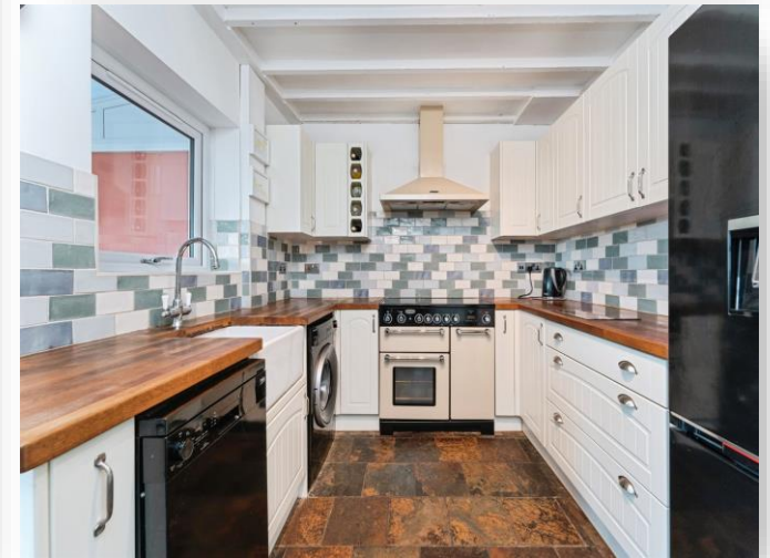
Hale Fen, Littleport CB6 1EJ