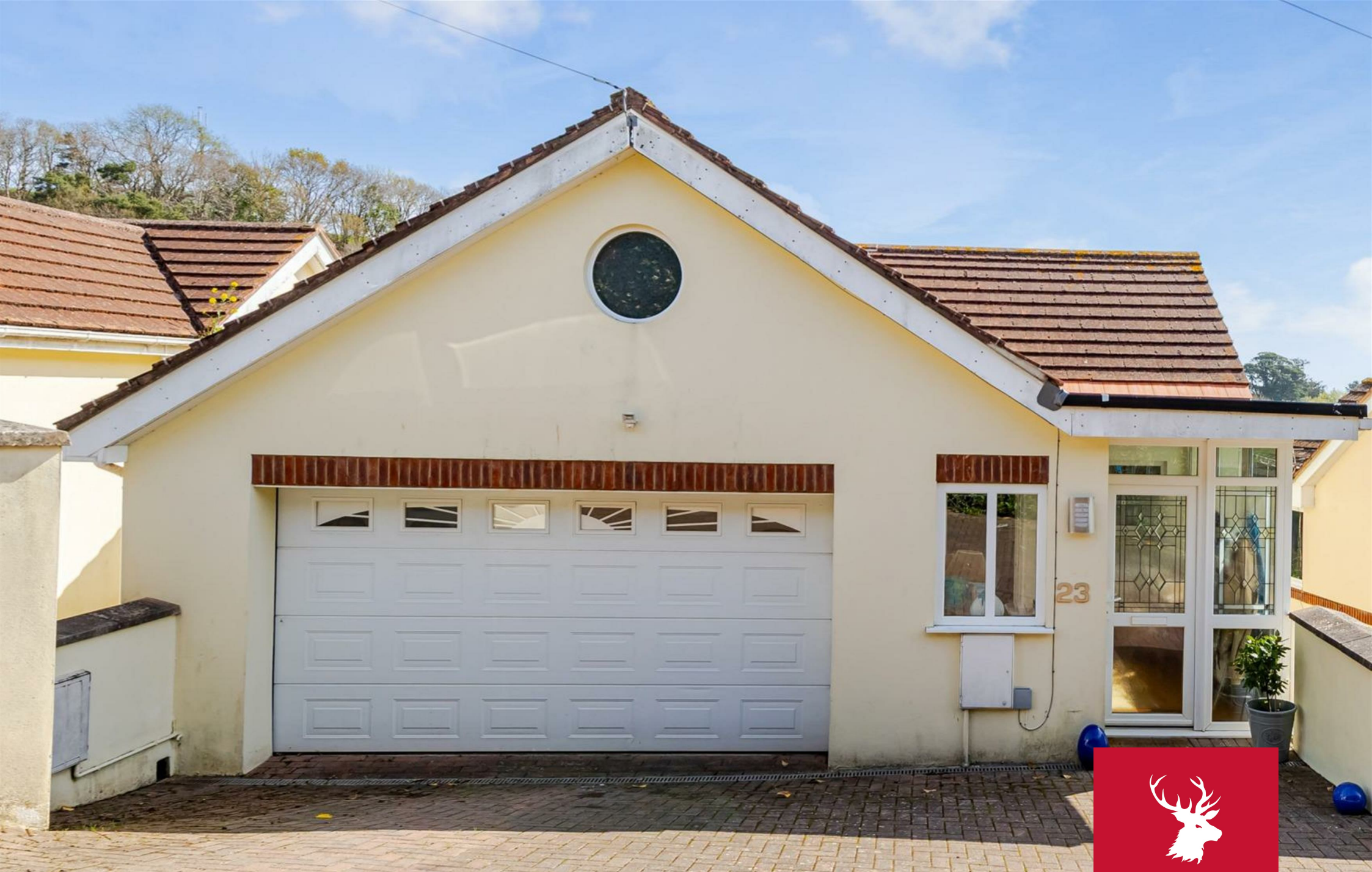
23 Windmill Gardens