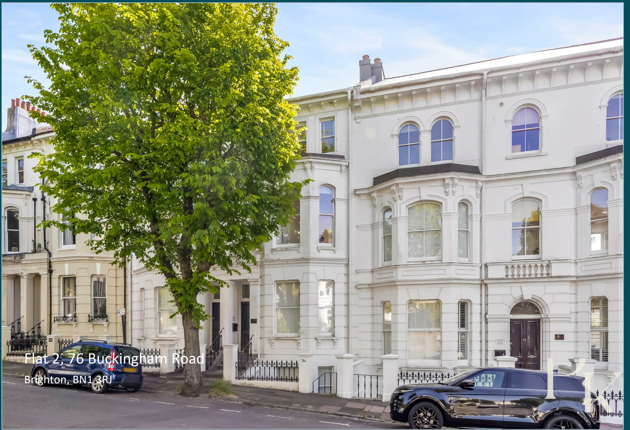
Flat 2, 76 Buckingham Road Brighton, BN1 3RJ