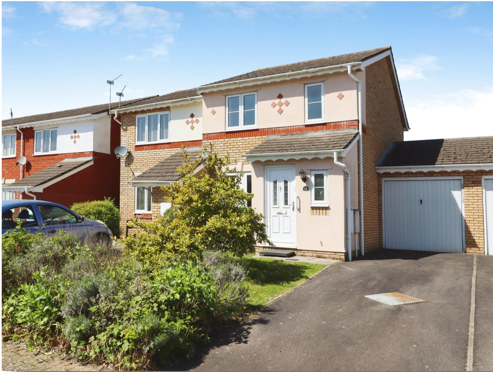
Rhodfa Sweldon, Barry CF62 5AD