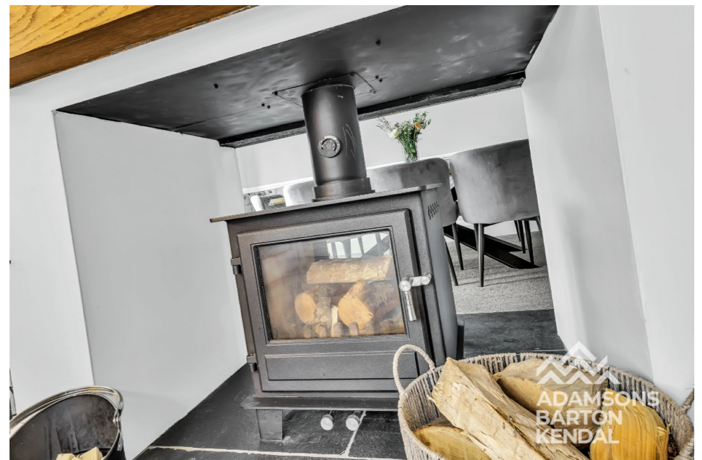
Arthington, Buckley Hill Lane, Rochdale OL16 4BU