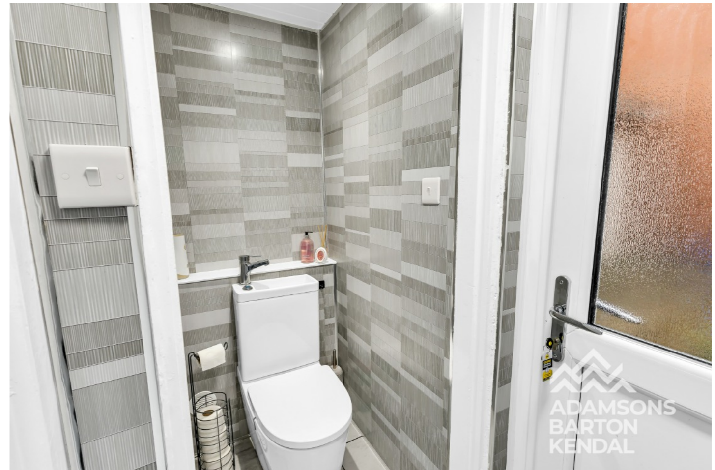
Arthington, Buckley Hill Lane, Rochdale OL16 4BU