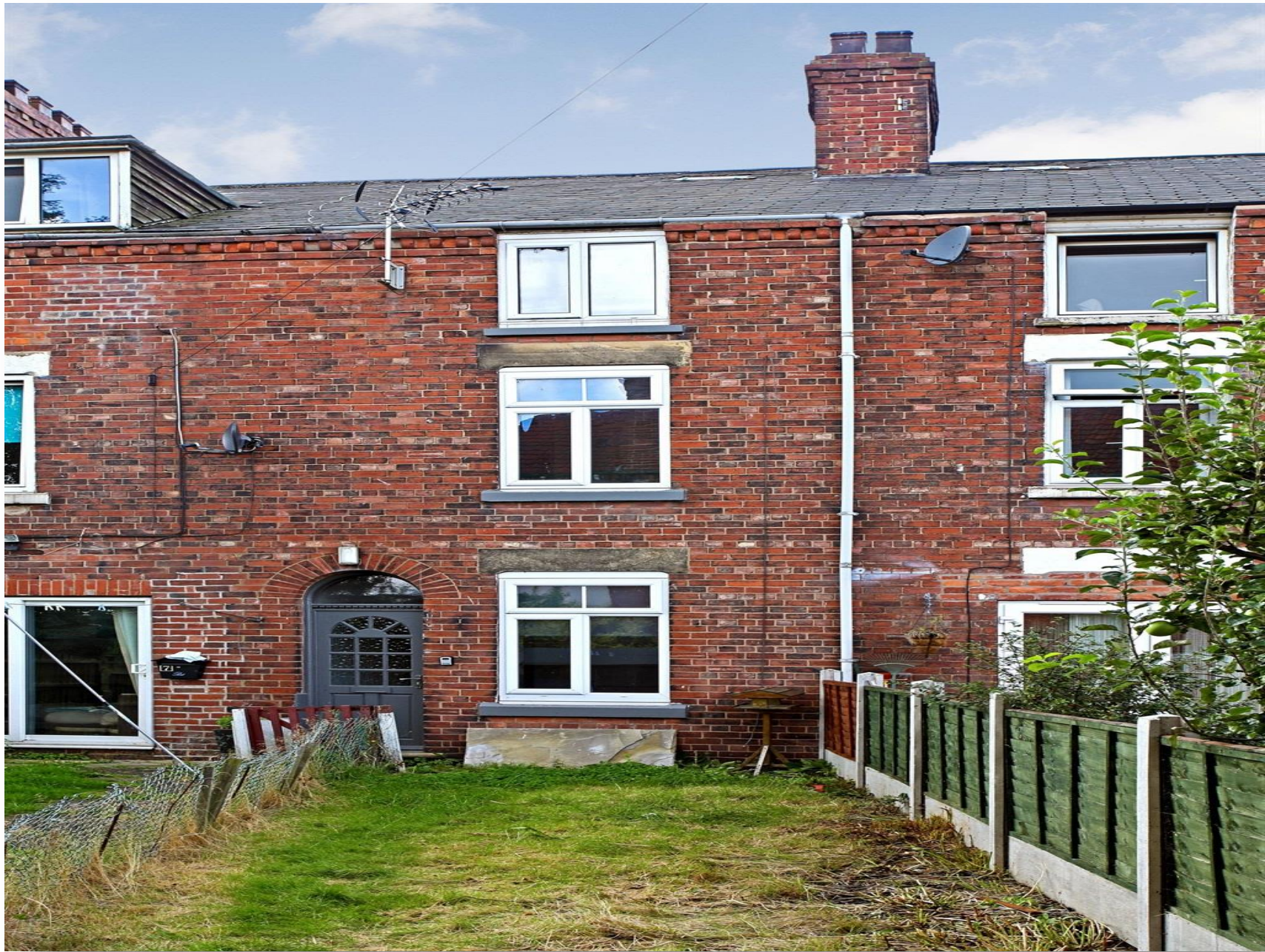
Westbourne Terrace, Selby YO8 9DF