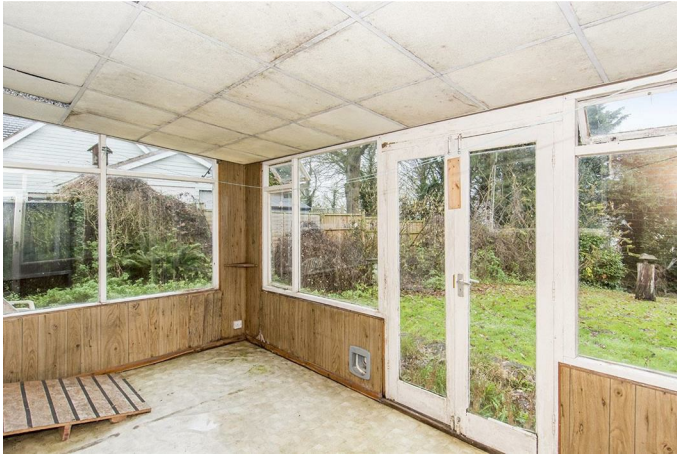
Lean-To 14'3" x 8'8" (4.34m x 2.64m)

Single glazed with glazed doors to the rear garden. Built in boiler cupboard housing oil fired central heating boiler.