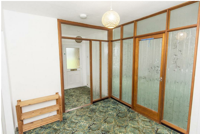
Porch 5'5" x 6'1" (1.65m x 1.85m)

Accessed via opaque double glazed front door. Radiator. Doorway to entrance hall and door to:-