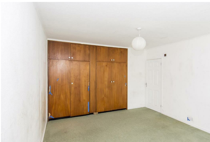
Bedroom One 13'9" x 12'3"

Double glazed window to the rear aspect. Built in wardrobes. Radiator.