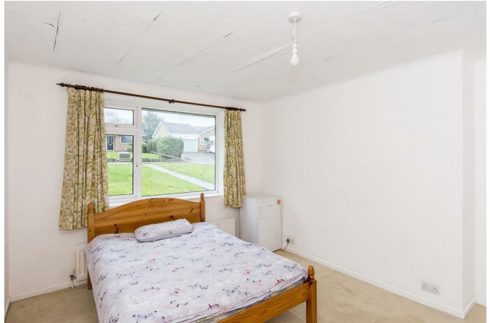
Bedroom Two 12'11" x 10'11" (3.94m x 3.33m)

Double glazed window to the front elevation. Built in wardrobes. Radiator.