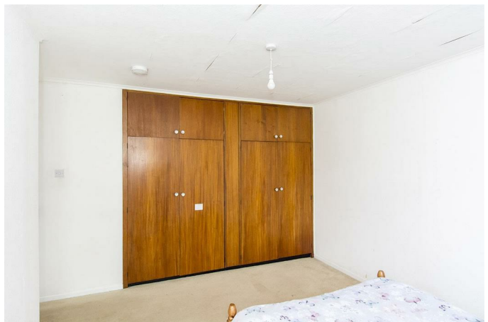
Bedroom Two Photo 2

Double glazed window to the front elevation. Built in wardrobes. Radiator.