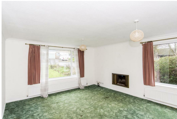
Living Room 16'9" x 14'4" (5.11m x 4.37m)

Double glazed windows to the front and side elevations. Recessed decorative fireplace. Two radiators. Television points.