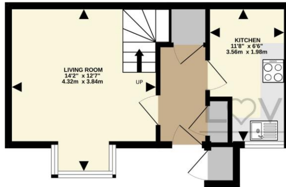
GROUND FLOOR 293 sq.ft. (27.2 sq.m.) approx.