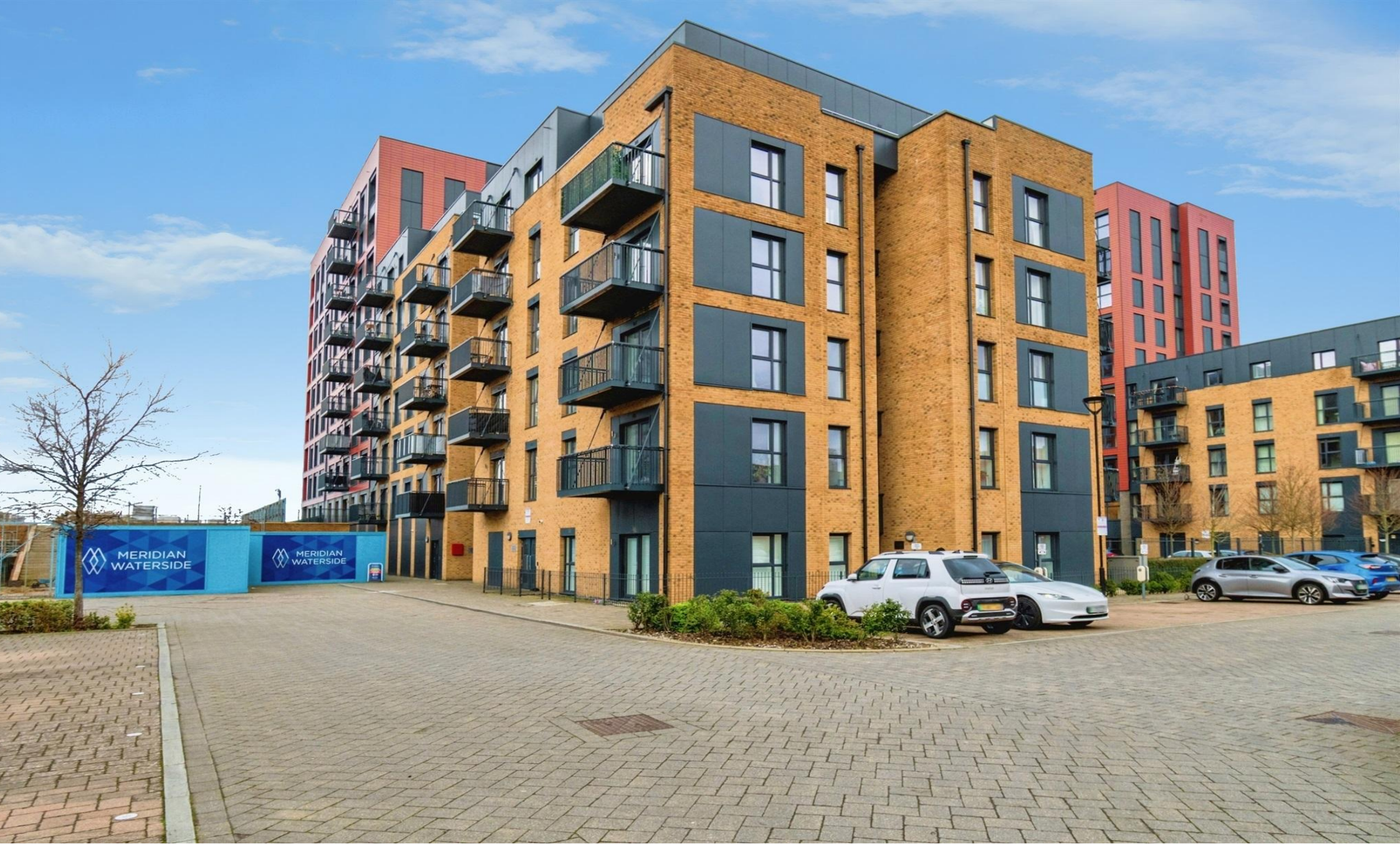
Granada House, Southampton SO14 0FT