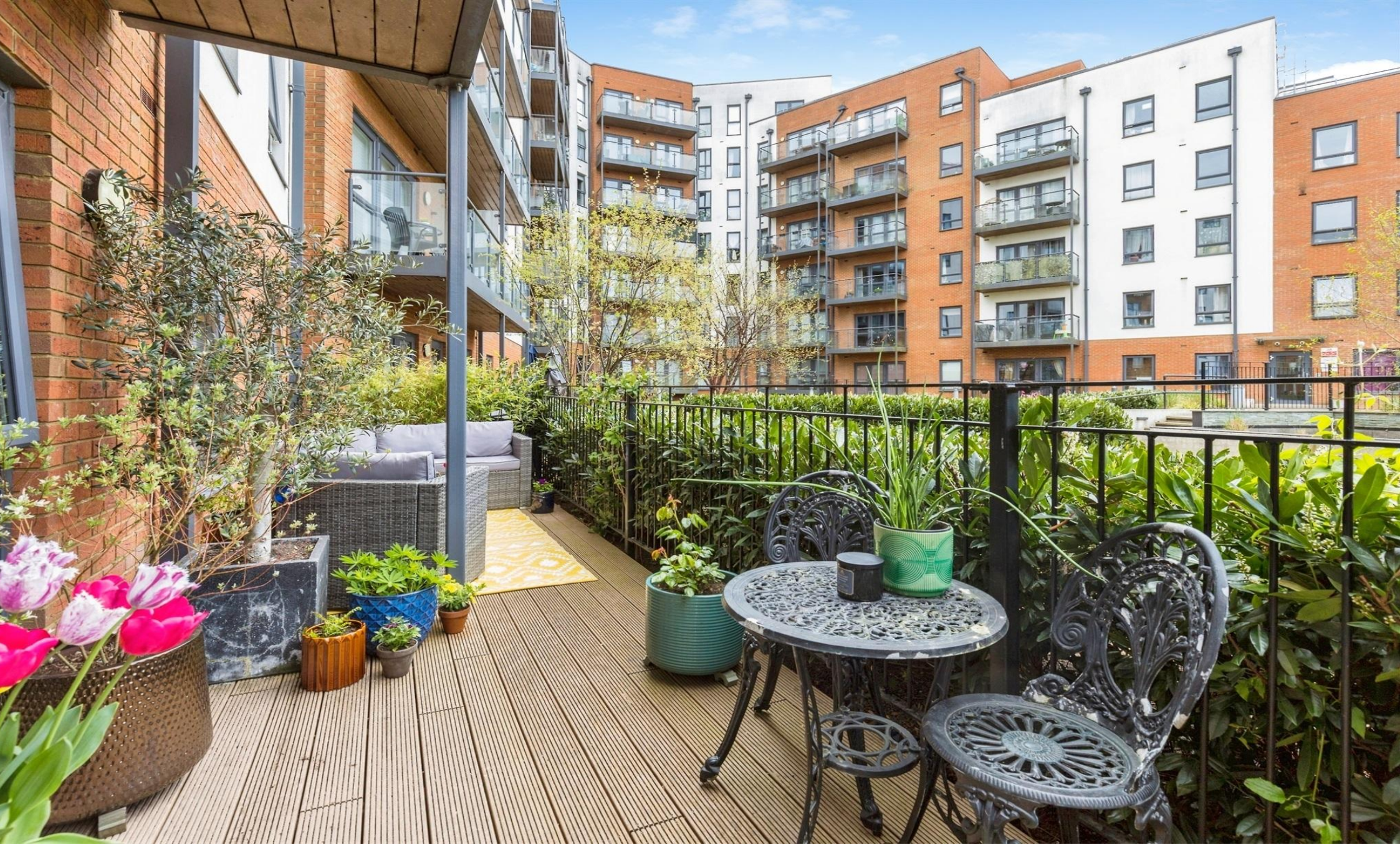
Apex Apartments West Green Drive, Crawley RH11 7QL