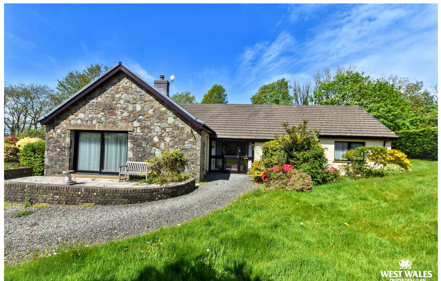
WEST WALES PROPERTIES CO.UK

This floorplan is only for illustrative purposes and is not to scale. Measurements of rooms, doors, windows, and any items are approximate and no responsibility is taken for any error, omission or mis-statement. Some of items such as bathroom suites are representations only and may not look like the real items. Made with Made Simple 260.