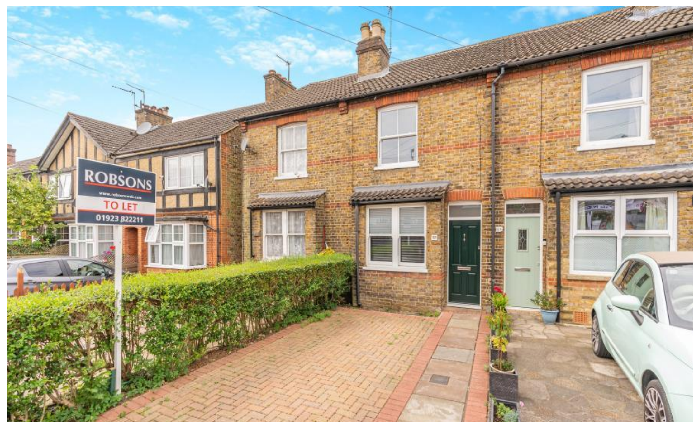
A three bedroom home in Old Northwood close to amenities High Street, Northwood, HA6 1ED