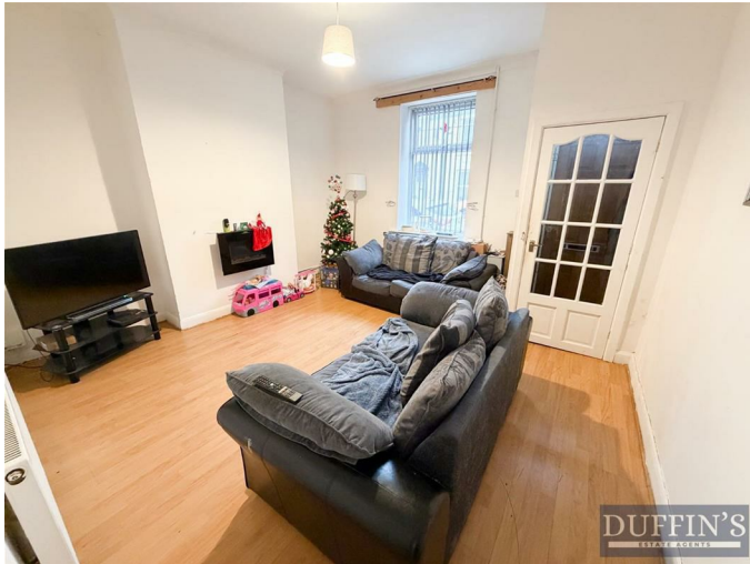
Lounge 15'5" x 14'0" (4.7 x 4.28)