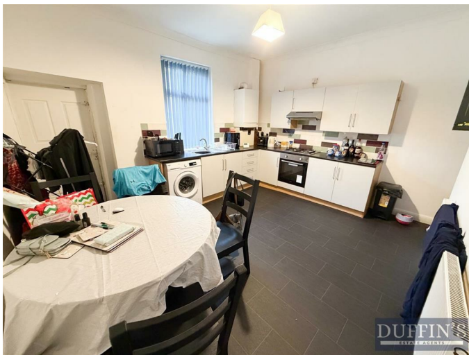
Kitchen 17'1" x 13'10" (5.23 x 4.24)