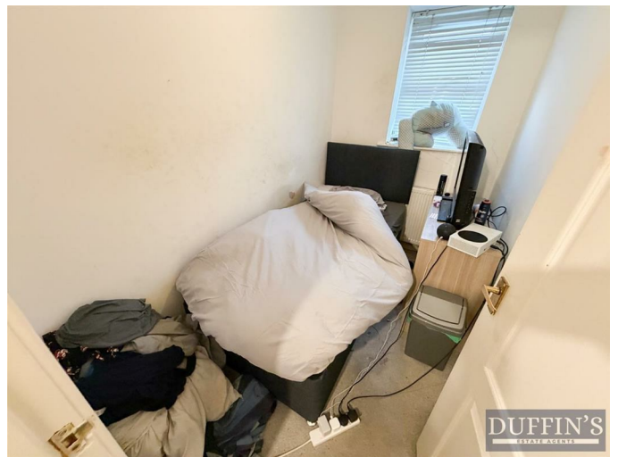
Bedroom Three 8'5" x 11'6" (2.59 x 3.51)