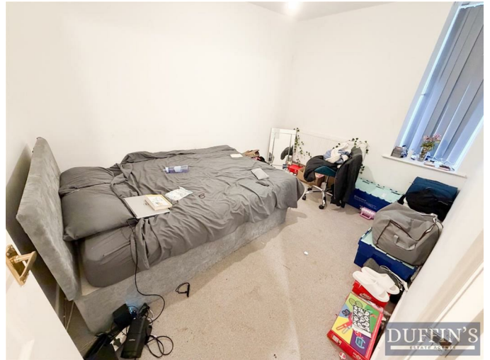
Bedroom Two 5'6" x 8'5" (1.7 x 2.58)