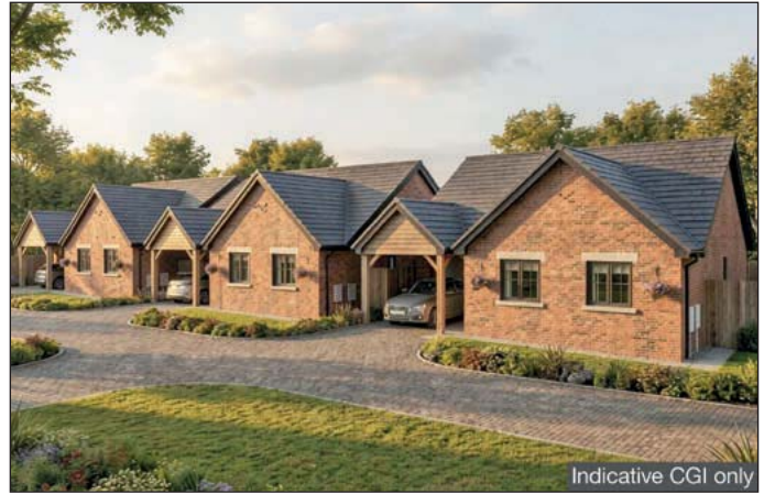
Indicative CGI only

By careful application to the site within daylight hours. Please see important advice for viewers on page 19 of this catalogue.