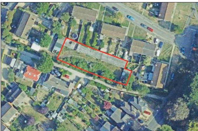
Licence Number: ES 100020372