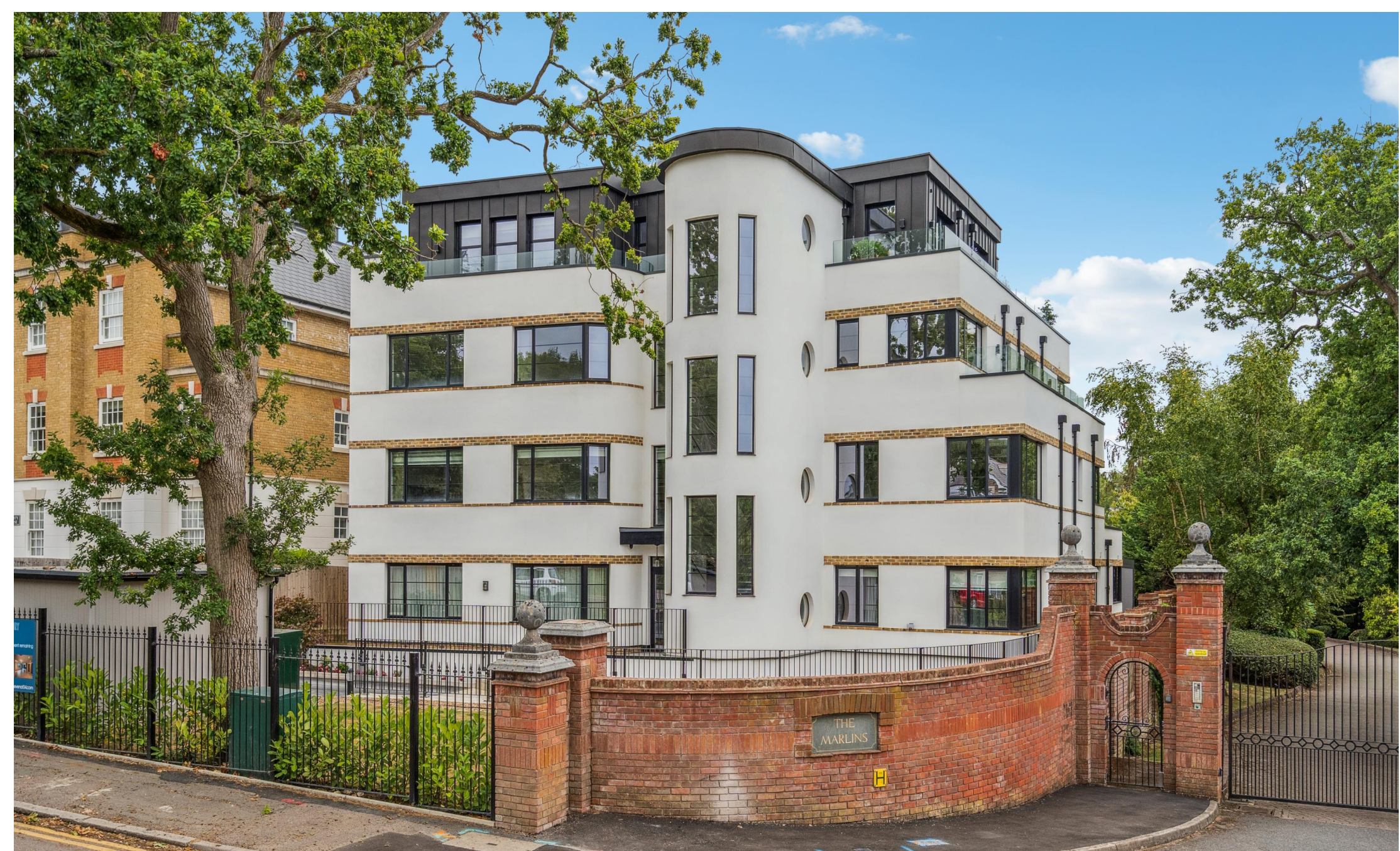
A contemporary two bedroom, two bathroom apartment with allocated parking Eastbury Avenue, Northwood, HA6 3LN