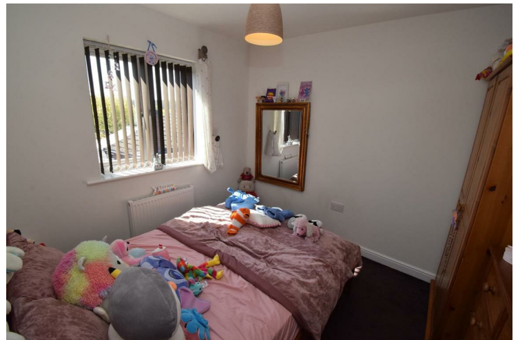
Bedroom 3 9'11" x 8'9" (3.03 x 2.67)

Third double bedroom with a radiator and double glazed rear window.