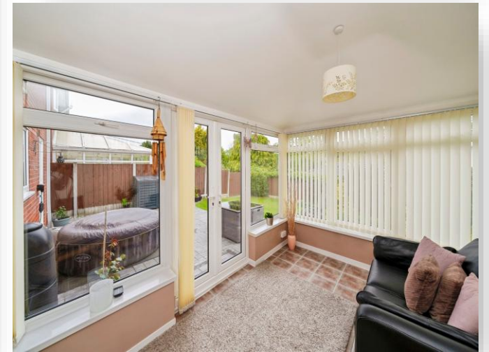
Long Acres, Wirral, CH49 2SP