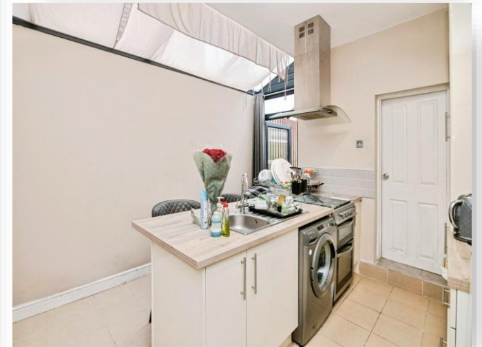
Rathbone Road, Smethwick B67 5JF