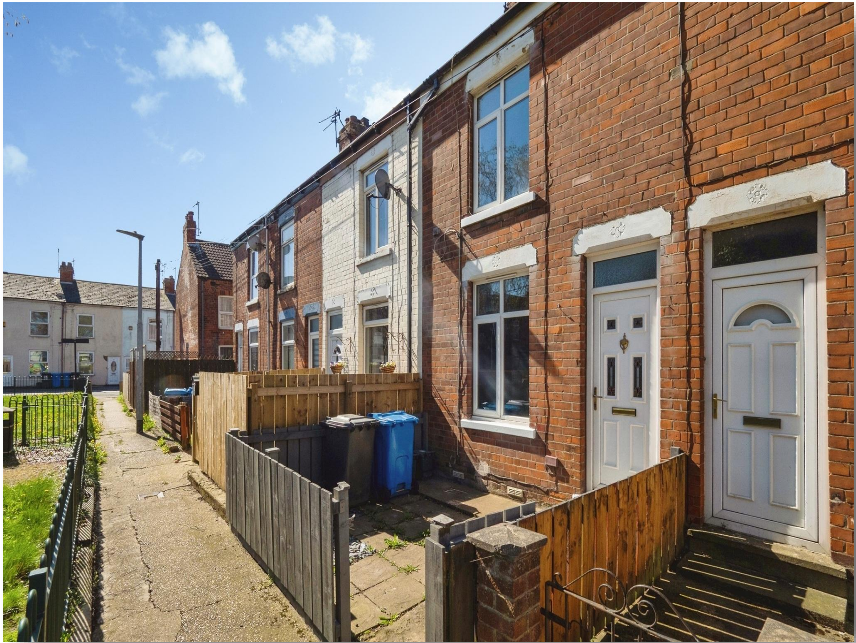
Nelson Villas, Hull, HU8 7HY