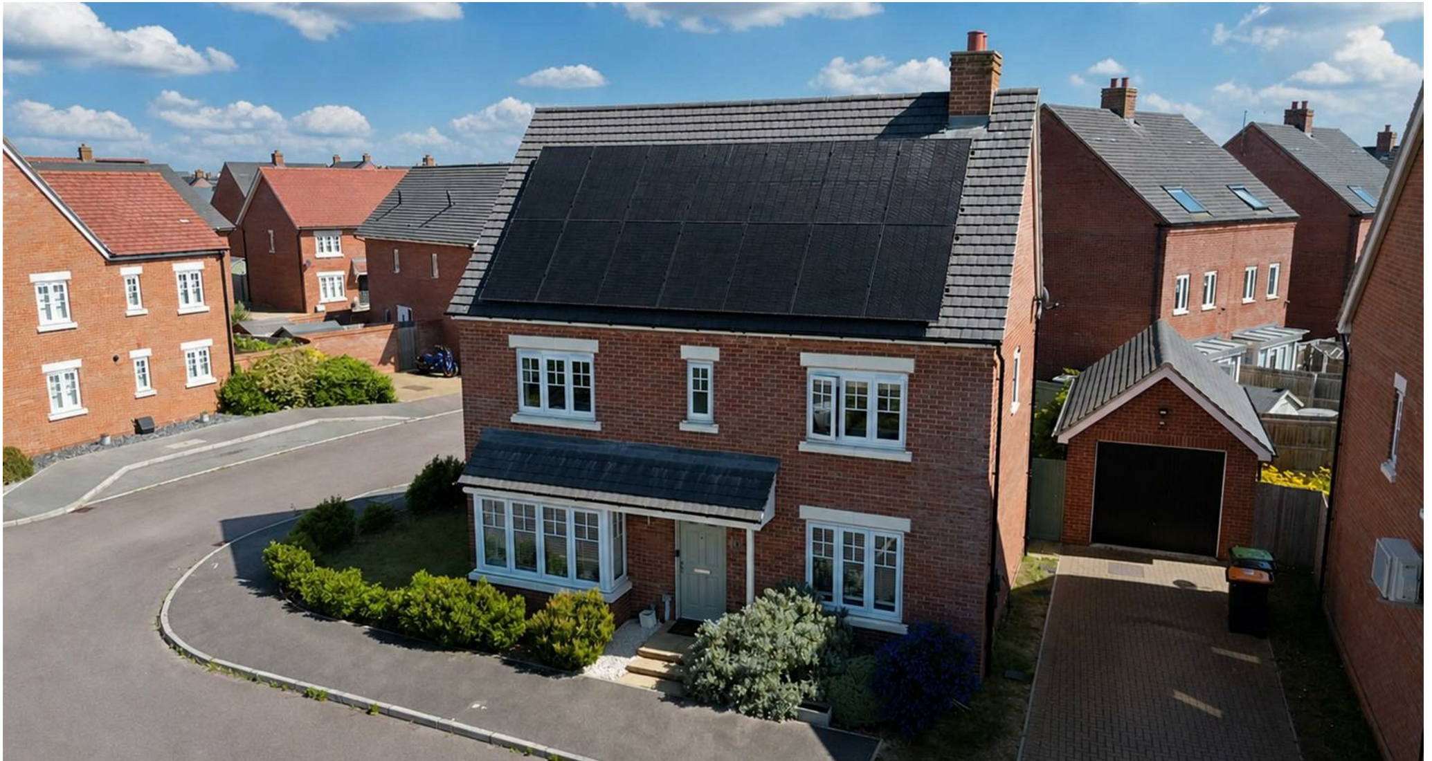
Bede Walk, Great Denham, Bedford, MK40 4TW £585,000 Freehold