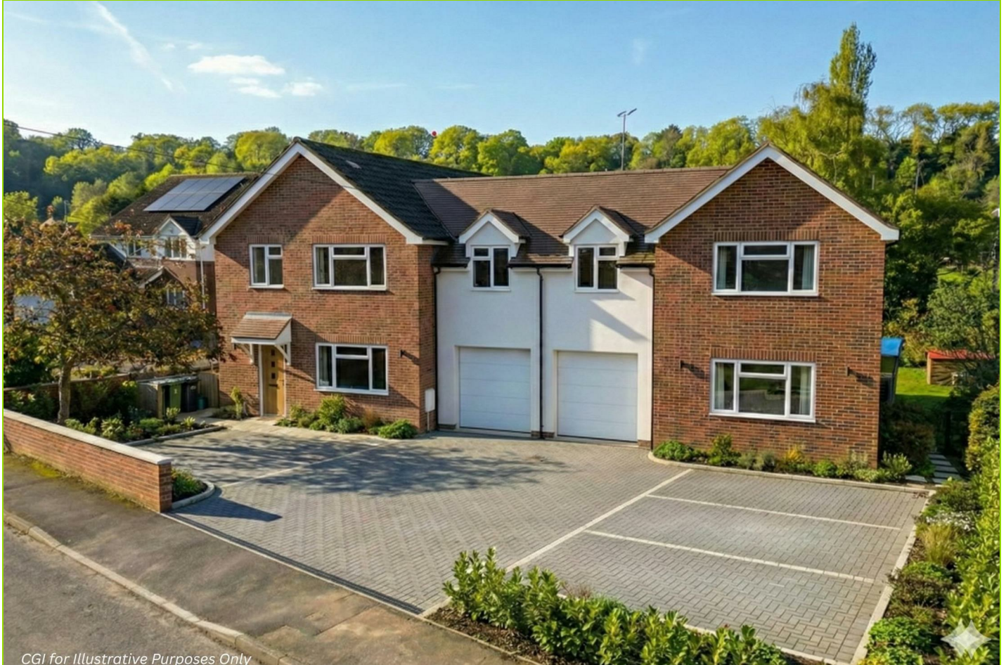
CGI for Illustrative Purposes Only