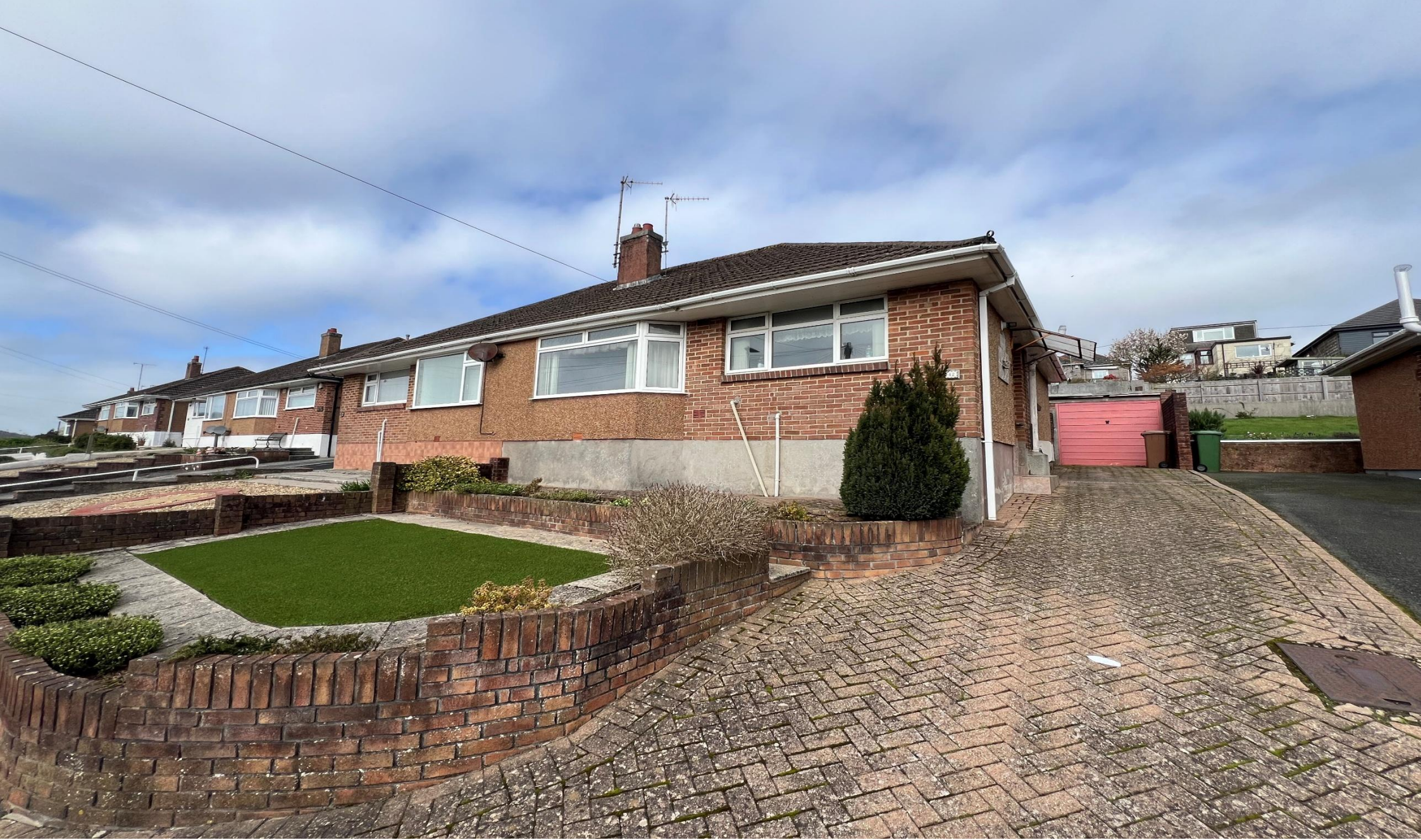
42 Green Park Road, Plymstock, Plymouth, Devon, PL9 9HY