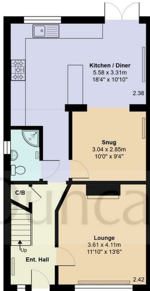
Ground Floor Area: 59.8 m 2 ... 644 ft 2