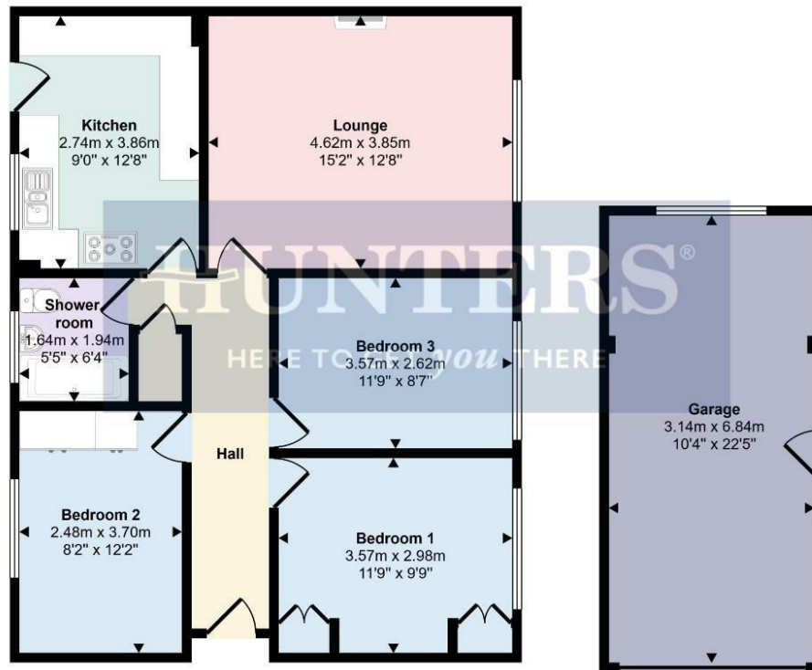
Floorplan Approx 73 sq m / 785 sq ft

Approx Gross Internal Area 94 sq m / 1016 sq ft