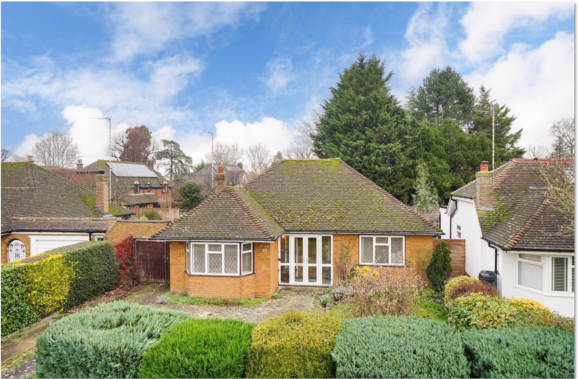
GROVE PARK, TRING, HP23 5JR