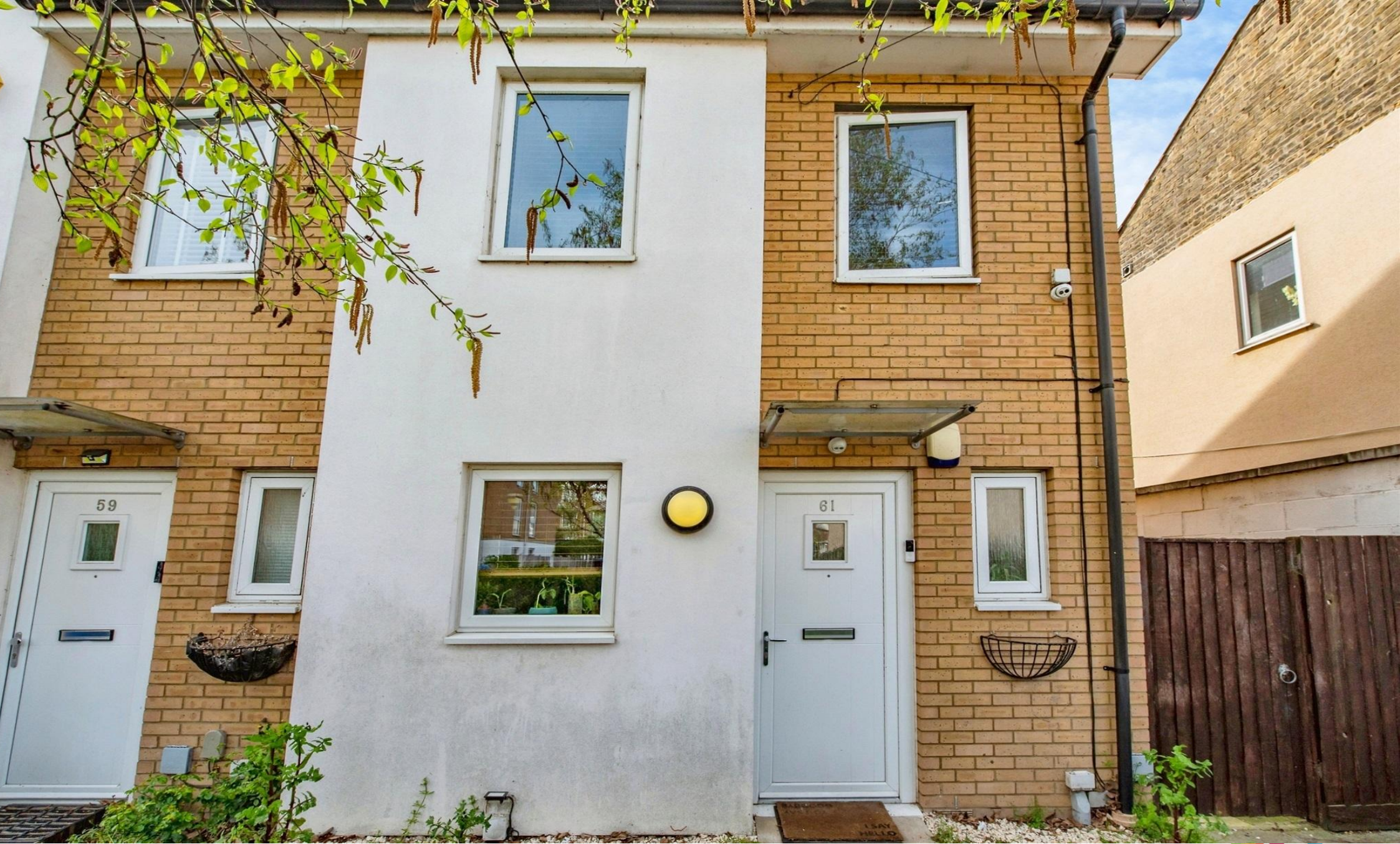
Saxton Close, Grays RM17 6FB