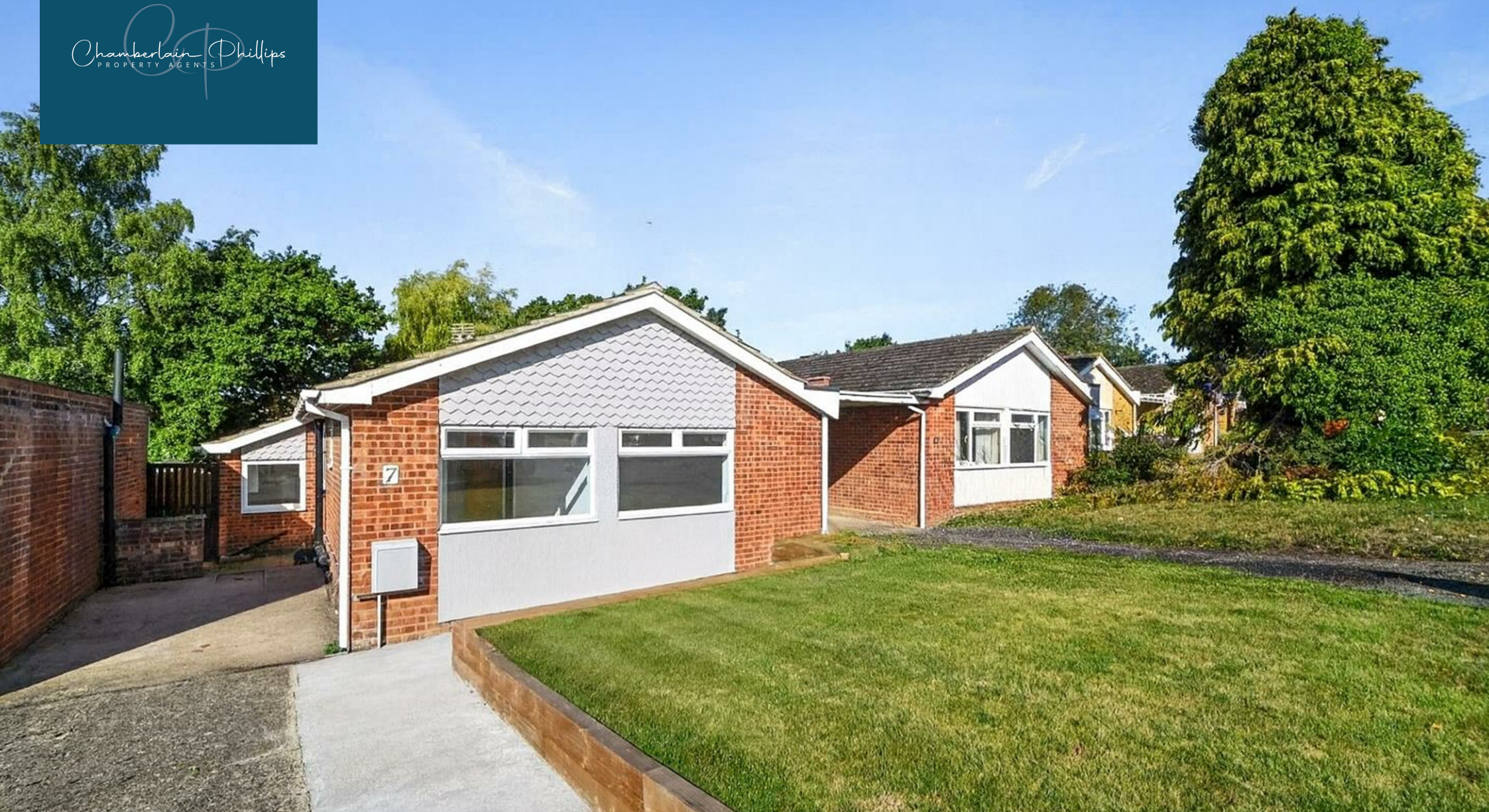
Rowley Close, Brantham £325,000