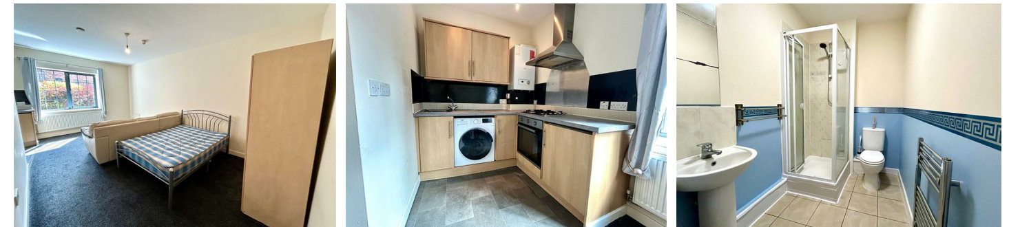
Apartment 18, 33, Cutlery Works Lambert Street, Sheffield, S3 7BG