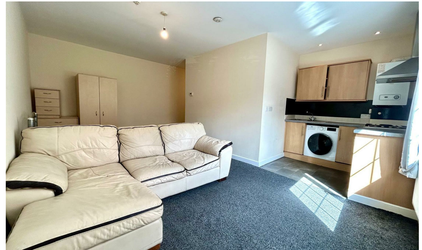
Apartment 18 Cutlery Works, 33 Lambert Street, Sheffield, S3