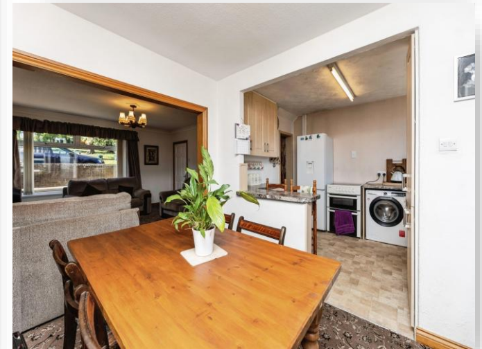
William Street, Morley Leeds LS27 7RE