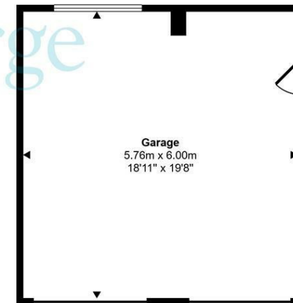
Garage Approx 35 sq m / 372 sq ft

This floorplan is only for illustrative purposes and is not to scale. Measurements of rooms, doors, windows, and any items are approximate and no responsibility is taken for any error, omission or mis-statement. Icons of items such as bathroom suites are representations only and may not look like the real items. Made with Made Snappy 360.