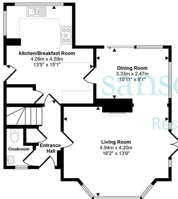
Ground Floor Approx 54 sq m / 584 sq ft

Approx Gross Internal Area 136 sq m / 1467 sq ft