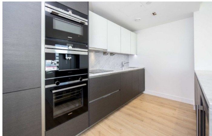
Glenthorne Road, W6