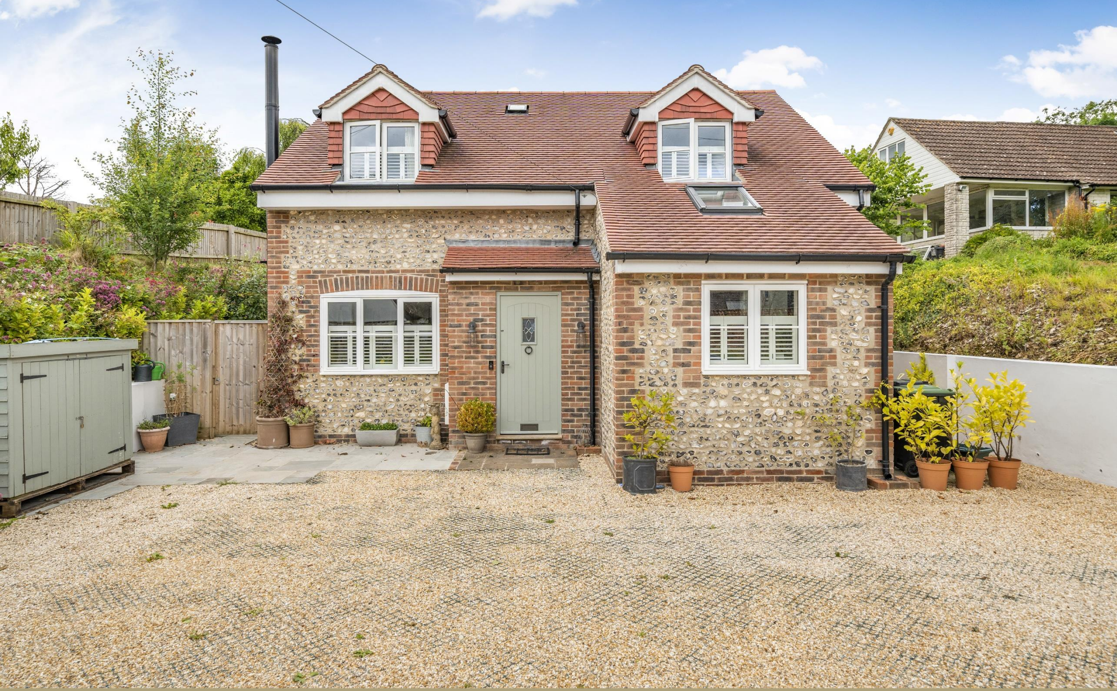
Vincita Cottage Godmanstone