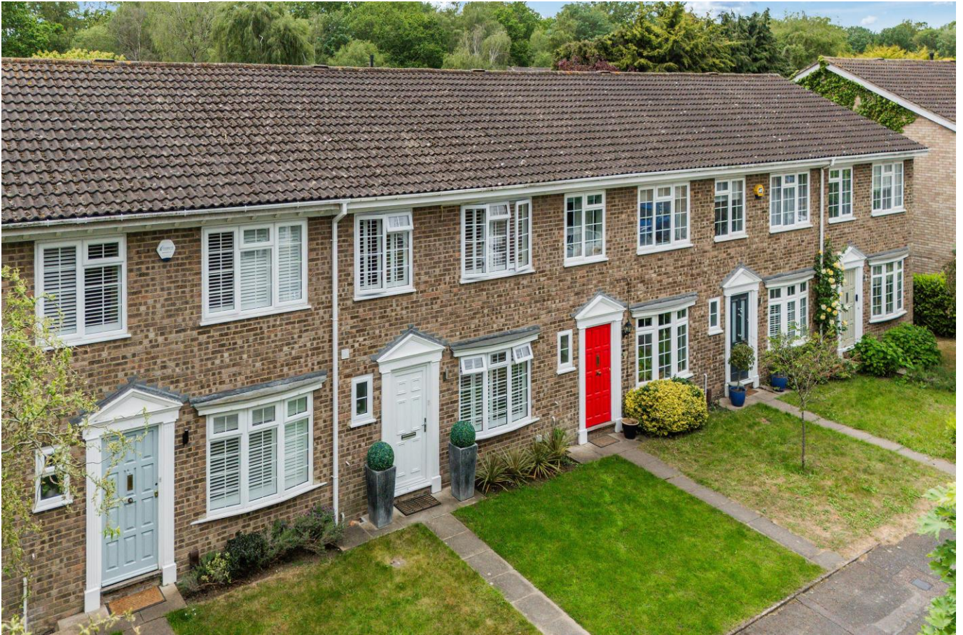
28 Mayfield Close Walton-On-Thames Surrey KT12 5PR