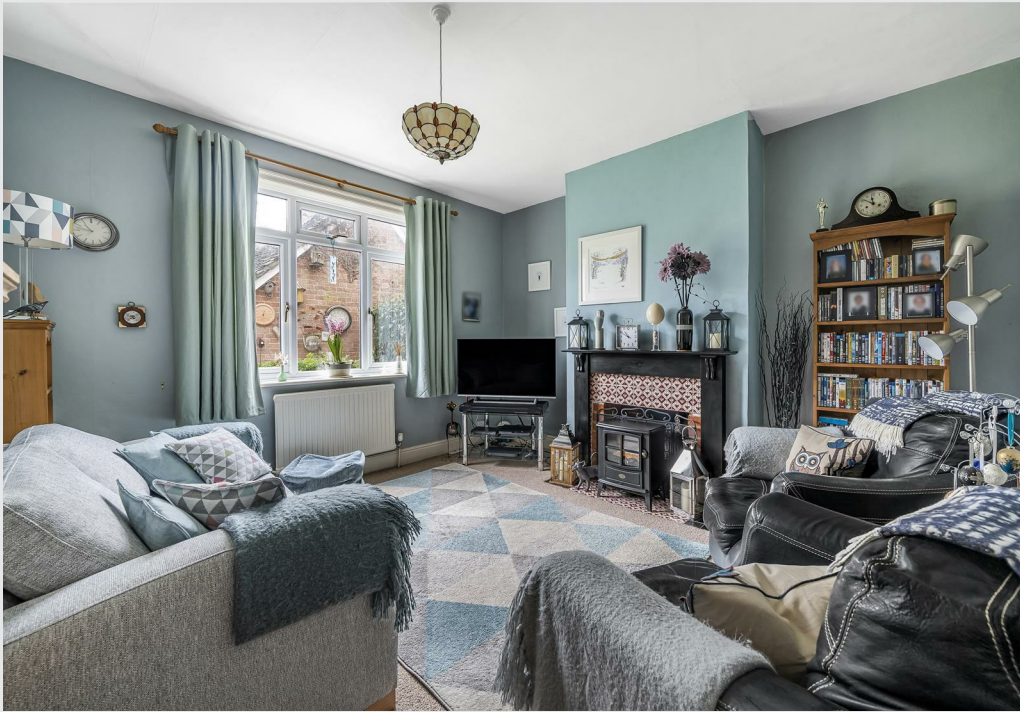
Cleverly extended character cottage located in a semi-rural location on the Ripley/Send Marsh border. Wonderful 'hub of the home' kitchen dining room, lovely garden. Potential to extend STPP and no onward chain.