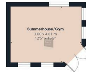
Ground floor Building 3