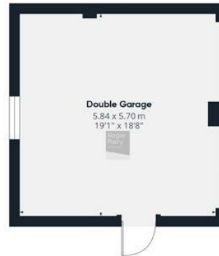
Ground floor Building 2