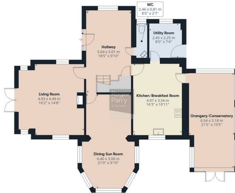
Ground floor Building 1