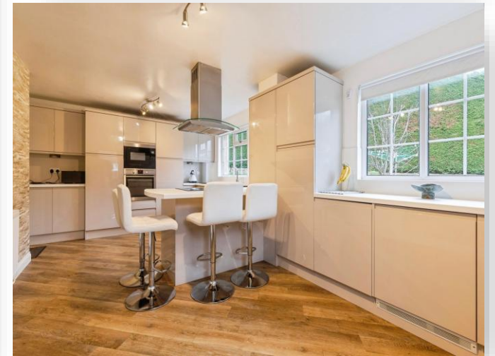
Hardwick Court, Hartlepool, TS26 0AZ