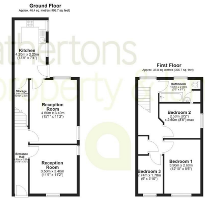
Total area: approx. 83.2 sq. metres (895.4 sq. feet) Provided for illustrative purposes only. Actual sizes and dimensions may vary from those shown. Plan produced using PlanIt.