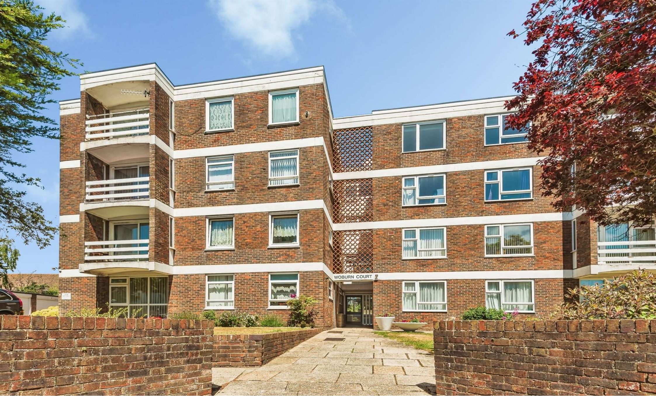
Woburn Court Richmond Road, Worthing BN11 4AE