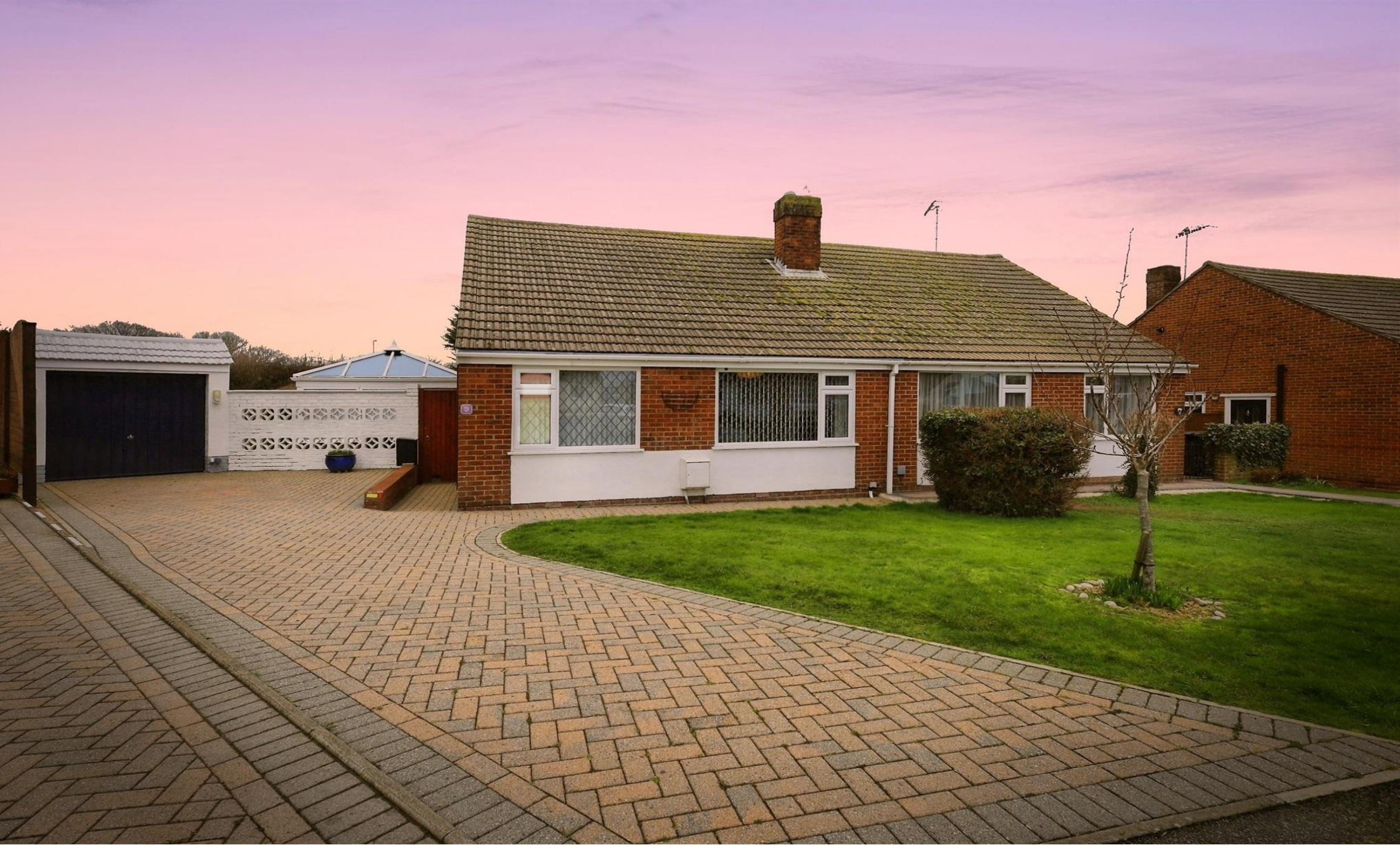
Mimosa Close, Polegate BN26 6PL