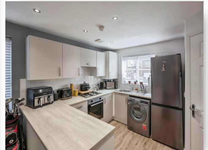
Blunn Croft, Kilnhurst Mexborough S64 5WJ