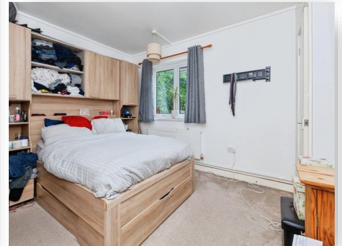
Millwood Close, Leicester LE4 2PX