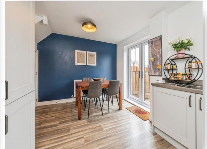
Poppy Gardens, Meltham Holmfirth HD9 5AQ