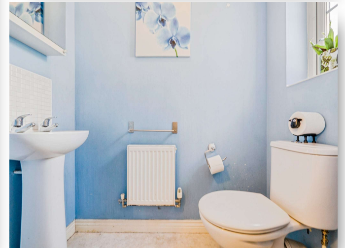
Brynheulog, Pentwyn Cardiff CF23 7JF