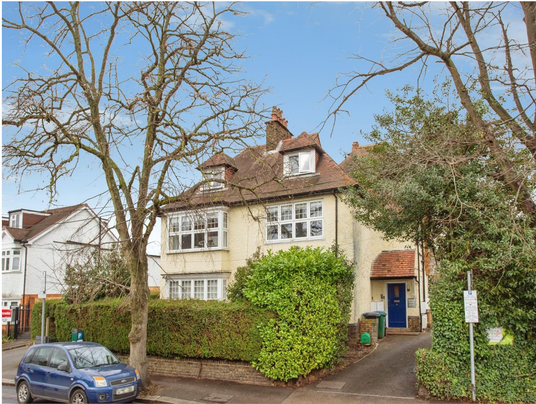
Denham Place, Park Avenue, Watford, WD18 7HA