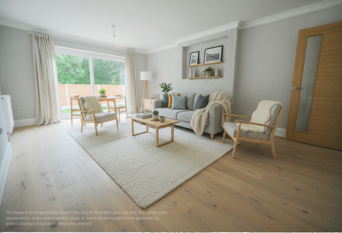
The image is an AI-generated creation intended for illustrative purposes only. It is not an exact representation of any natural person, place, or event but an original artwork generated by artificial intelligence based on descriptive prompts.