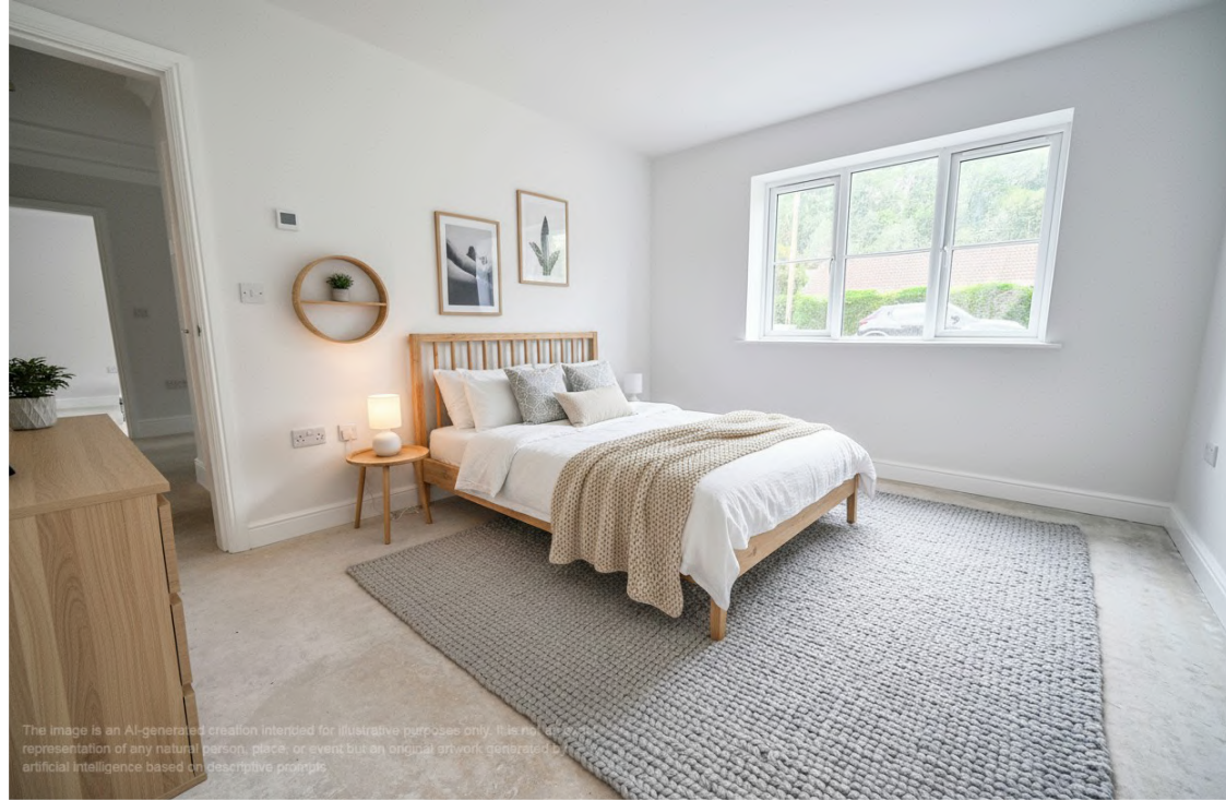
The image is an AI-generated creation intended for illustrative purposes only. It is not an exact representation of any natural person, place, or event but an original artwork generated by artificial intelligence based on descriptive prompts.