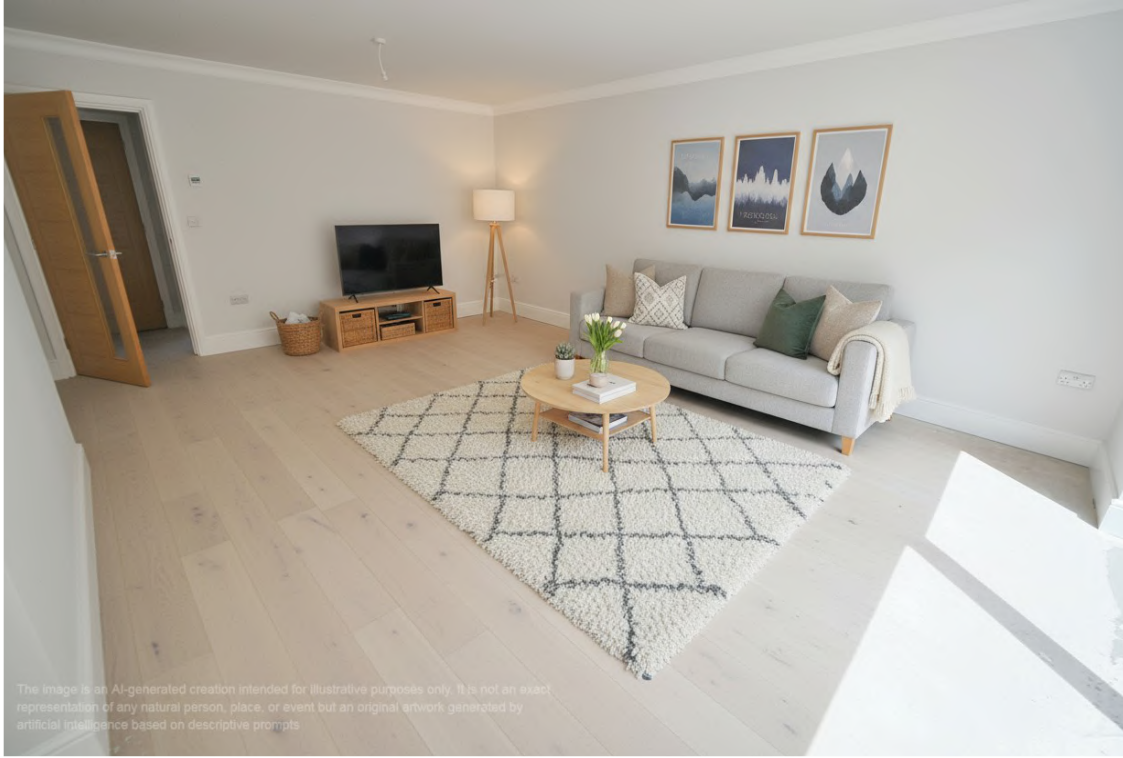
The image is an AI-generated creation intended for illustrative purposes only. It is not an exact representation of any natural person, place, or event but an original artwork generated by artificial intelligence based on descriptive prompts.