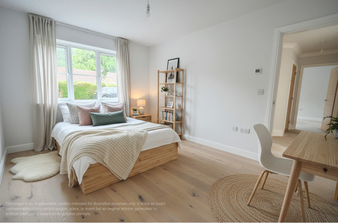
The image is an AI-generated creation intended for illustrative purposes only. It is not an exact representation of any natural person, place, or event but an original artwork generated by artificial intelligence based on descriptive prompts.