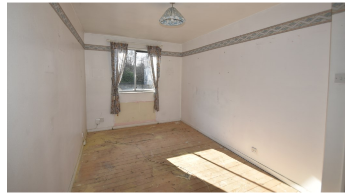
175 Clement Rise