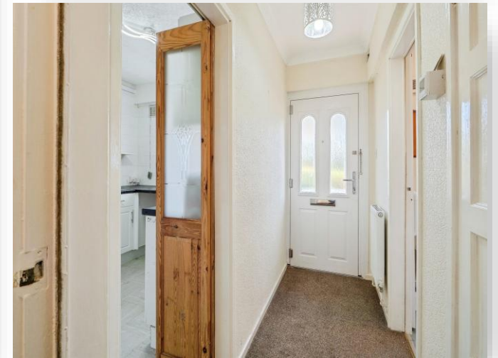
Garendon Green, Loughborough