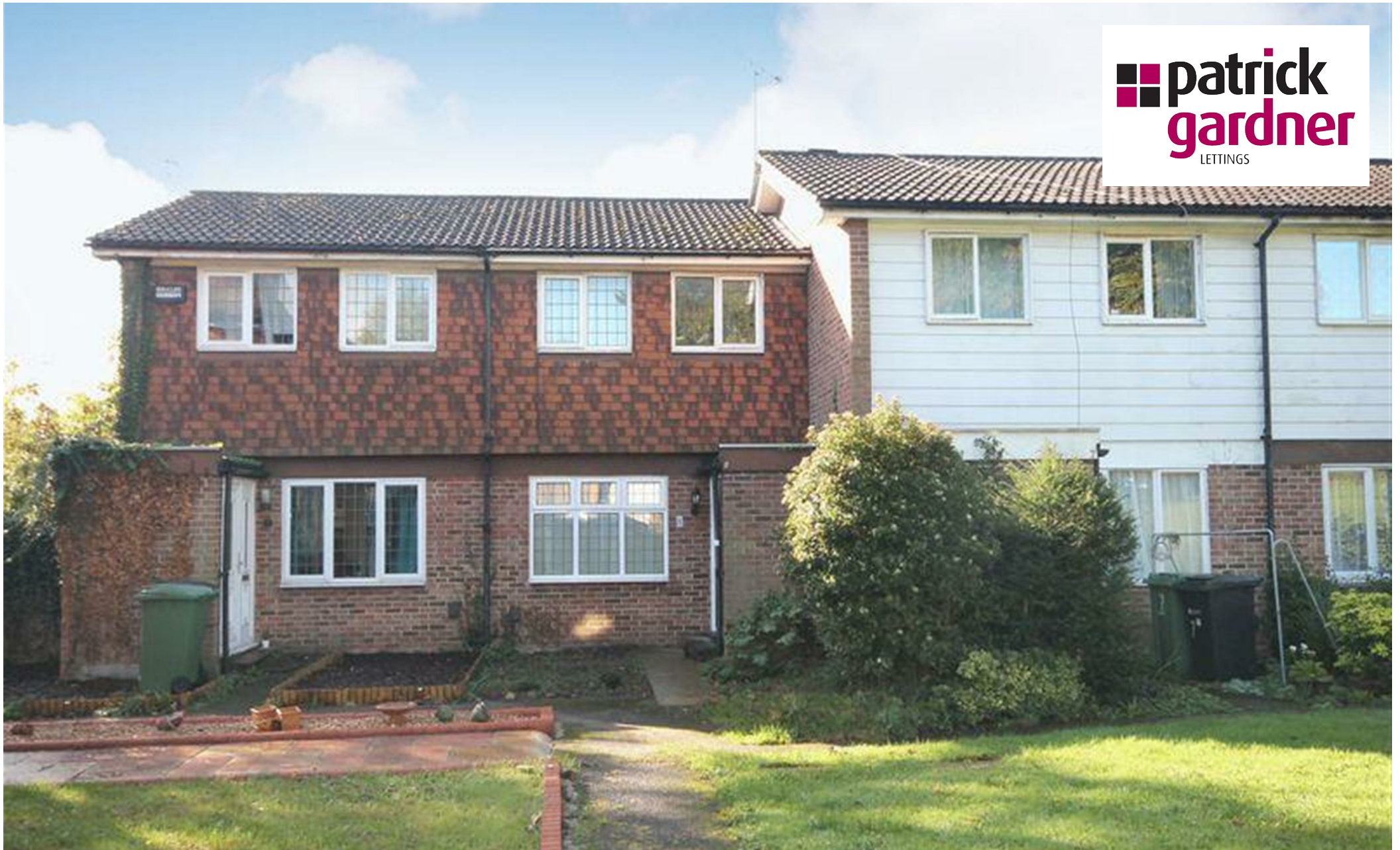
Oaks Close, Leatherhead, KT22 7SJ